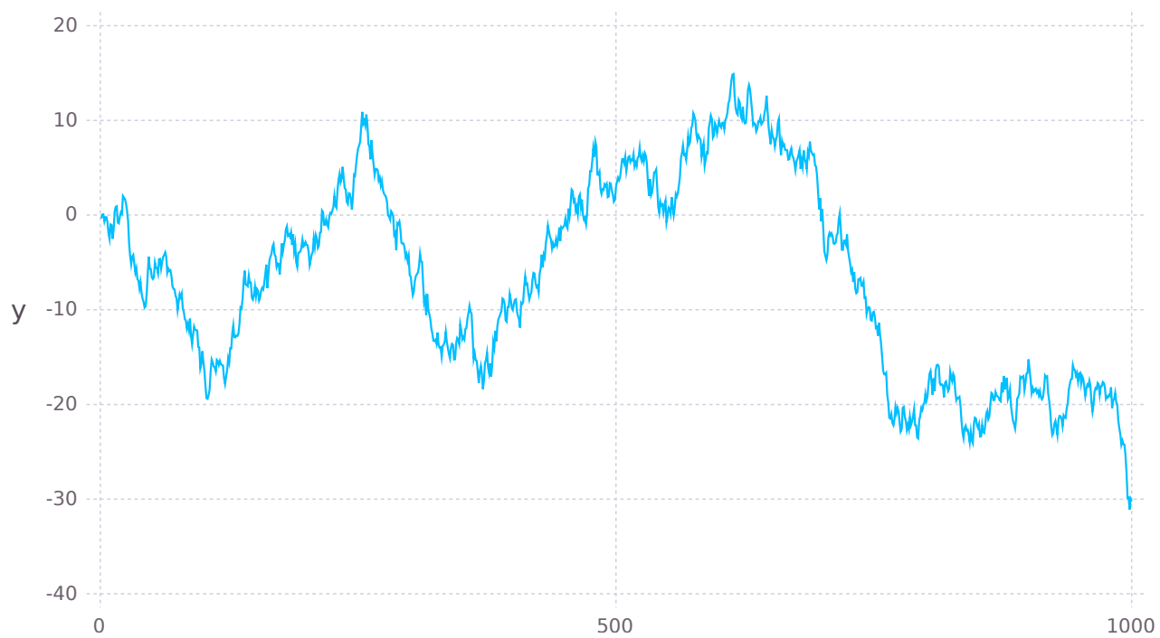
Figure 1: A random walk.